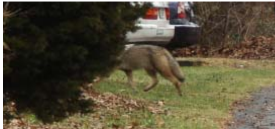
Clyde the Coyote Flees in Terror at Cannon Blast

Braving leaden, but dry skies, fifty-one hardy runners awaited the cannon's call New Year's Day morning at 11 a.m. for the first event of the Falmouth Track Club's season, the annual Hangover Classic. Maps advertising the course indicated an official route of 7.38 miles from Sippewissett Place to Quissett Harbor and Carey Lane and return, but many of the participants demonstrated their creative (or lazy) sides in forging new, more scenic, and sometimes shorter versions.