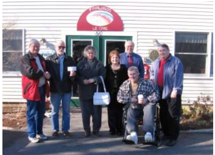
Presenting a check to Fairwinds

line the stairway walls. I recognized several whom I have encountered at a variety of retail locations in Falmouth. On the way out, again several clients went out of their way to come over and say good-bye.