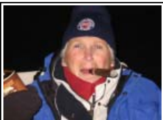
Our Supervisory staff (above) closely monitors personnel and details during the race.

With all that paraphernalia, the club is prepared to step out and offer its equipment and services (for a reasonable fee, of course) to local race organizers. We will come to a race with an experienced staff, who between them have close to 300 races under their belts. And they