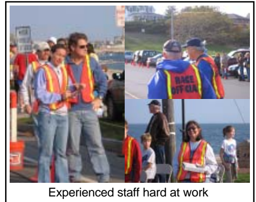
Experienced staff hard at work

Remember, the FTC scoring and timing experts who will work your event are volunteers. All fees go to support club activities.