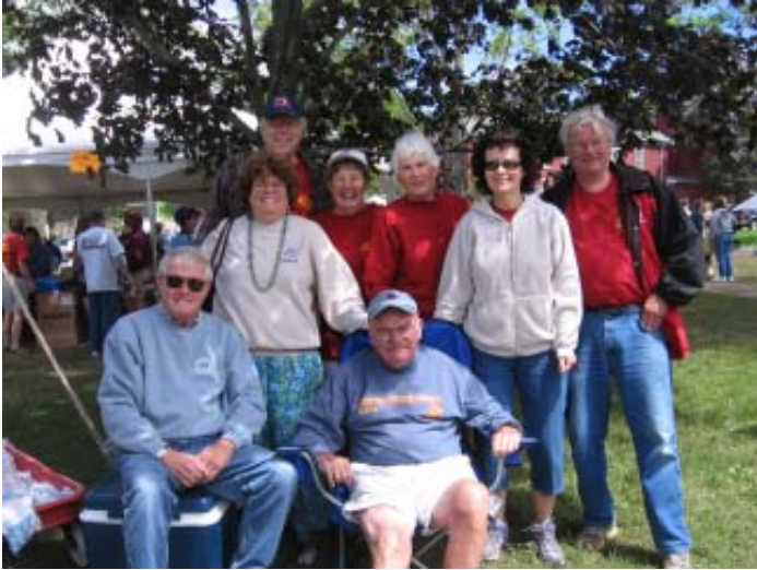
The 2006 "Road Crew"

The runners finish coming down the slight decline, the road splits the village green on one side and the Village Pub on the other. Seated in a place of honor, right in the road, is his royalship