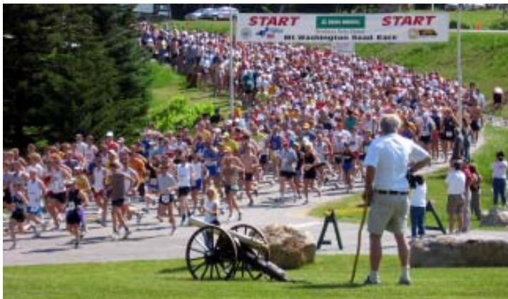
The Official FTC Cannon, known in military annals as the "Richards Gun," starts the 2006 Mt. Washington Road Race. It's next appearances will be at the Falmouth Walk and at the Bird's to kick off the New Black Eagle Jazz Band