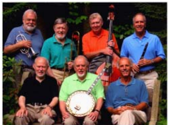
The New Black Eagle Jazz Band

For more information about the NBEJB, check out their website at http://www.black eagles.com/ . They will have a selection of their numerous CD's available to buy at the Birds' party.