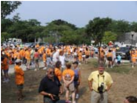
The Gathering Crowd for the '05 Walk

The Friday night sign-up was held at Lawrence's Restaurant and attracted about 50 walkers. This first annual "Falmouth Walk" began at the Heights by the Casino and followed the route of the Falmouth Road Race in reverse. They picked up the Bike Path at Surf Drive to avoid the roads and finished at the Library at Woods Hole. Tommy had arranged for a bus to take everyone back. However, it showed up almost 2 hours late! But, as usual, a good time was had by all. Only a two days later, "Bob" obliterated the Bike Path and Surf Drive.