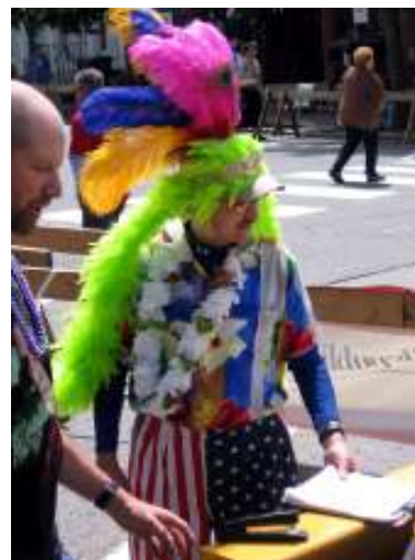
The Hawk prepares to announce the race

celebrate former race organizers and race committee members who have embarked, we hope, on a heavenly journey.