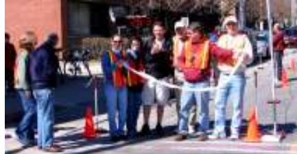
Sparing no expense, the finish line crew unfurls a roll of toilet paper for the winner's tape

The 30th Annual Seagull Six road Race will take place Sunday April 1, 2007 at 11:00 A.M. This year's race will be part of the Hockomock Swamp Rat Grand Prix Series, meaning that it is 1 of 21 races chosen in the New England