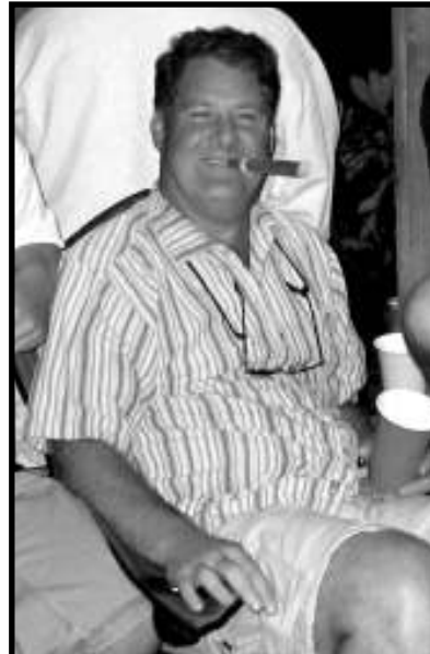
Pictures don't lie... Even in a short time, have the trappings of power corrupted our new leader, thus lending credence to Lord Acton's famous dictum ???