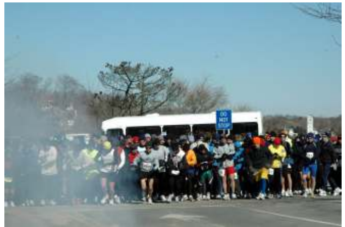
Boom!! The official FTC Cannon starts the 2007 MV 20 miler. For reasons dictated by the Department of Homeland Security, the actual cannon cannot be shown.