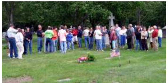
Graveyard Tour participants gather at graveside to toast one of the fallen

And of course, there's the party. "The Village," a pub sometimes referred to as the Quarterdeck West, is the main watering hole. For the shoppers, the Village Green is host to a large craft fair on Saturday of that weekend. Other races have an expo the day before the event, but Litchfield goes another route. They have a graveyard tour to remember and