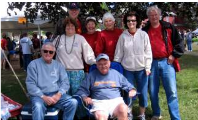
The Official FTC Delegation to the 2006 Litchfield Hills Road Race

It's coming around again -- the 31st running of the western version of Tommy Leonard's Falmouth Road Race, also known as the Litchfield Hills Road Race. It's happening on the second Sunday of June. What makes Litchfield unique and so much fun is that the race is an excuse to have a weekend-long party that for many doesn't end until the wee hours of the Monday night after the race when the last morsel of a day-long brunch is eaten and the last beer from the "Open Bud Open" golf tournament is quaffed!