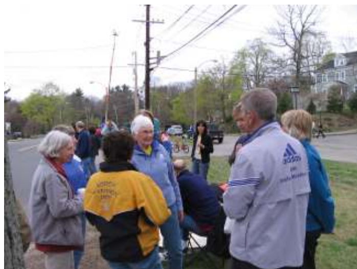
The 30k cheering squad in action

old posts to cheer on the the runners. The 30k is on Commonwealth Ave in Newton about 2/10's of a mile east of Chestnut Street and at the end of Wauwinet Road. For directions that keep you from getting on the wrong side of Commonwealth Ave. and enable you to get to the Mass Pike and, of course, the Lenox, contact the Birds at 508-548-0348 or courtney.bird@verizon.net .